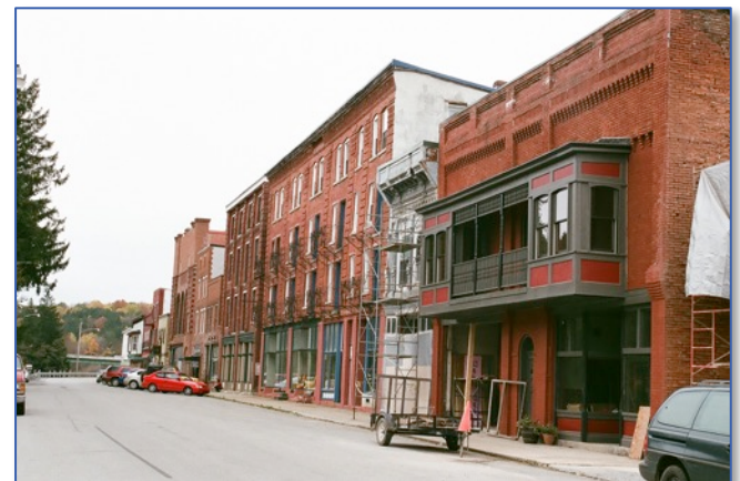
Thomas, WV Commercial Historic District walking tour, historictomas.org