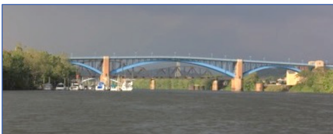
Allegheny River, Pittsburgh, PA Mussel Survey field work and reporting