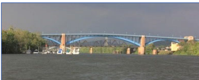
Allegheny River, Pittsburgh, PA Mussel Survey field work and reporting