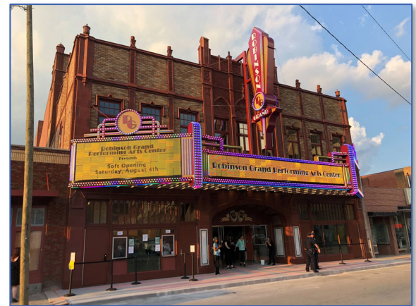
Robinson Grand Theater renovation, Clarksburg, WV; preservation consultant