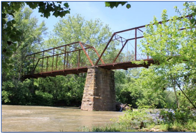
Shiloh Bridge Replacement, Tyler Co., WV Section 106 review and mitigation